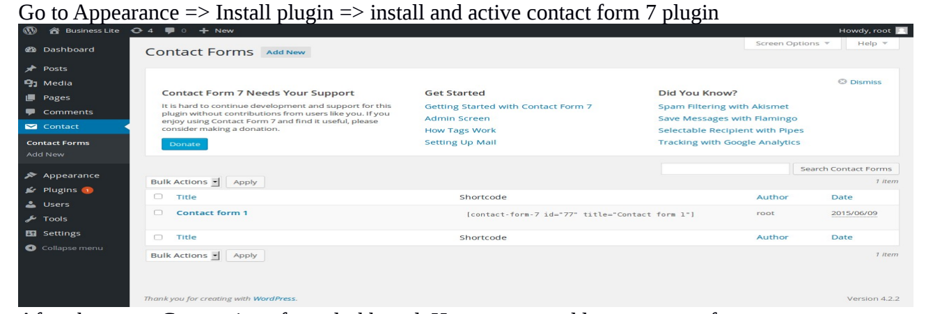
After that go to Contact icon from dashboard. Here you can add your contact form.